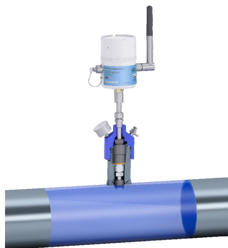
Microcor® Wireless Corrosion Monitoring System

This allows the engineer to instantly tweak and fine-tune the level of inhibitor chemical used, without having to wait each time to see the eventual effect. Not only does this save on inhibitor chemical, it lessens risk and improves visibility and control.