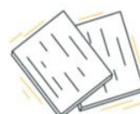
Sheet & Plates