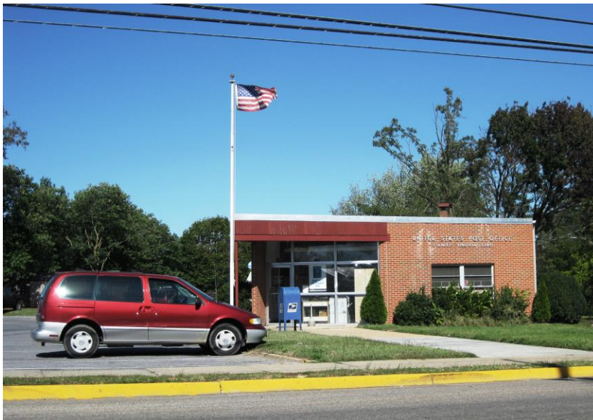
Stanley Post Office

The Post office at this time is considered inadequate. There is a need for expanded and more parking at the facility as well as the need for additional space for more post office boxes. In general the Town will need to go through the State Government and the U.S. Postal Service in order to have a new Post Office facility built within the Town to better serves its citizens.