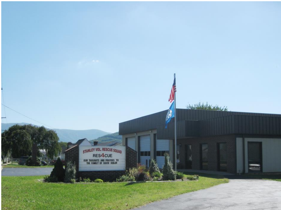
Stanley Volunteer Rescue Squad

The Rescue Squad has twenty members that consist 20 members whose training range from certified drivers, to emergency medical technicians to enhanced technicians. The County supplements the shortage of volunteers by providing one paid medic ten hours per day seven days per week. The squad has four box units, one first response vehicle, one command vehicle, and a boat. All members are notified by a pager system from the Page County Emergency Operations Center in Luray.