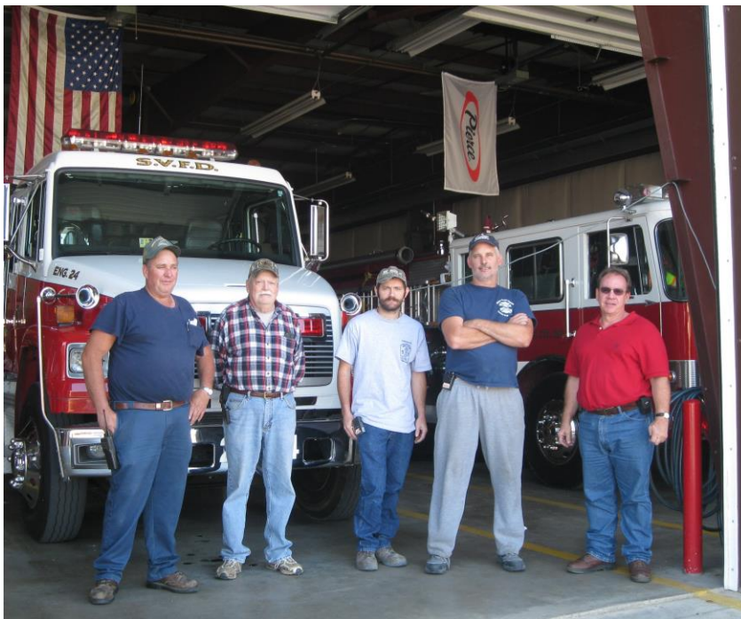
Stanley Volunteer Fire Department

The fire department serves the Town of Stanley and the surrounding area consisting of approximately 90 square miles. The fire department receives its calls through the use of a paging system activated by the Page County Emergency Operations Center in Luray.