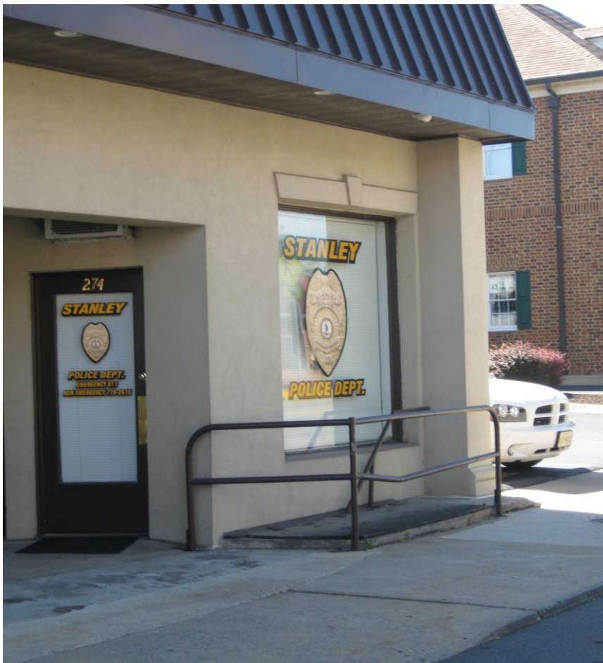
Stanley Police Department

Page County also has a Sheriff's Department consisting of fifty-two full time and eight part time deputies and serves the County of Page as well as the towns within. The Sheriff's department handles all after hour calls for the Town, allowing for 24-hour protection. The central dispatch office is located in Luray and serves as a dispatcher for all service calls in the Town. In addition to its own exclusive radio frequency, the dispatch network system includes the County Sheriff's, town police departments, and the Virginia State Police.