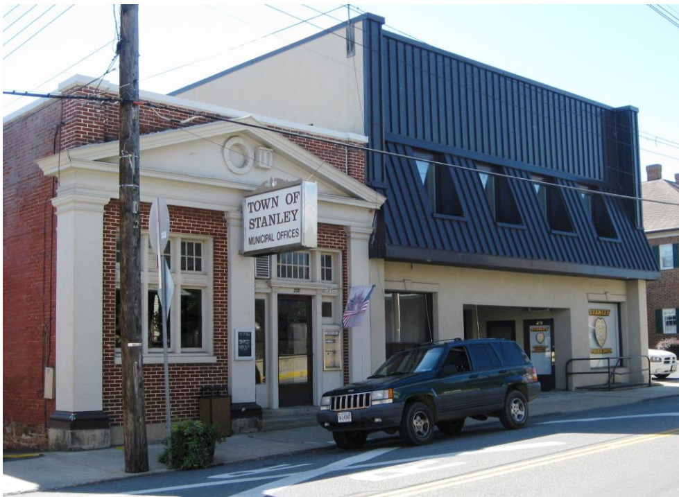
Town of Stanley – Municipal Office Building

One issue that does need to be addressed for the Town is the improvements or building of a new municipal office building to better serve the citizens of Stanley. Currently the municipal office does not meet the needs of the staff and does not offer adequate meeting space. The Town has purchased property just below where the current municipal office sits. This property is also part of the four-acre tract mentioned within Parks and Recreation section of this chapter. The Town has applied for grant funding to facilitate building construction with the intent to build a new municipal office building on this property in conjunction with the initiative to work on creating a Community Park/ Natural Preserve and revitalize the Central Business District. The Town should continue to actively pursue grant funding for this important capital facilities project.