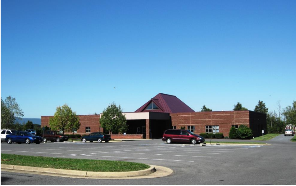
Page Rural Health Center - Stanley

Over the past decade, the Town has continued to build its infrastructure and has developed partnerships with county, regional, and state agencies to implement its development goals and objectives. Recently, the Town implemented a boundary line adjustment incorporating new agricultural lands into the Towns limits.