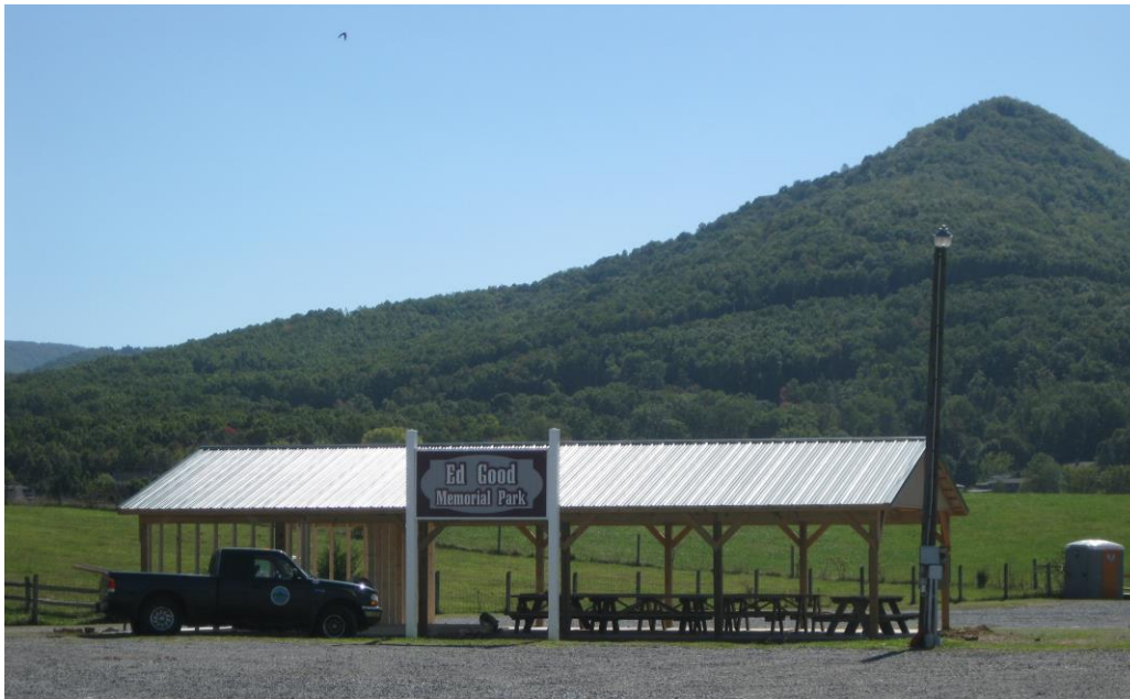
Ed Good Memorial Park

The Town has also purchased four-acres near the center of Town off of East Main Street (Ed Good Memorial Park) which is being used for carnivals and the Homecoming Festival. It is also the location of the recently constructed skate park. The Town is planning on using this land for green space and future Park development. Plans for the near future at Ed Good Memorial Park include a proposed playground, picnic shelter, and walking trail.