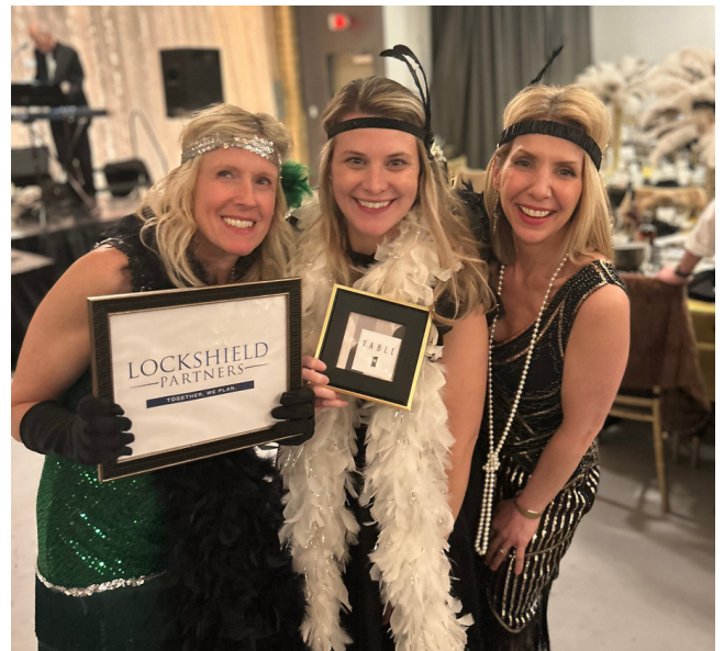
Looking good, ladies!