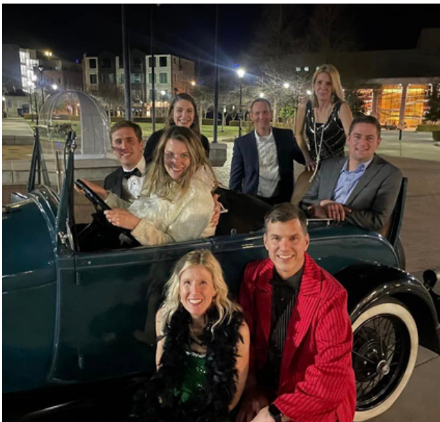
Thanks to La Gala for hosting!

St. Joseph School is a wonderful option in the area that serves Preschool-8th grade students. Many members of the Lockshield family have attended or been involved with St. Joseph School.