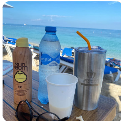
Tyler soaking up the sun in Cozumel, Mexico.