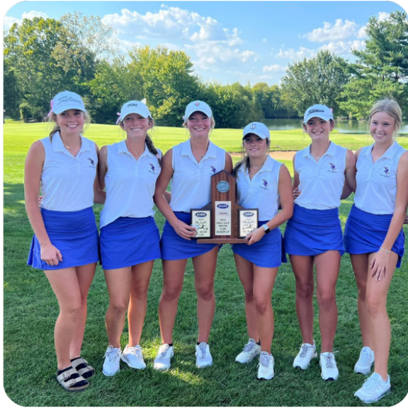
Lady Purples Golf Team qualified for the State Tournament. Only the top 9 teams in the state make it to this tournament. Go Purples!