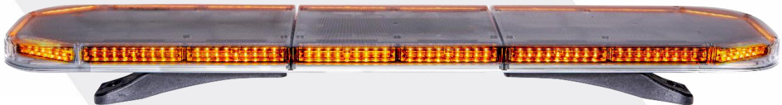
• Side view