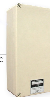
DataCheck® Receiver DC-RX-SR-O-S3 (installed outdoors)