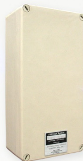
DataCheck® Repeater DC-RP-12-S3 (applied as needed, boosts all transmitters)