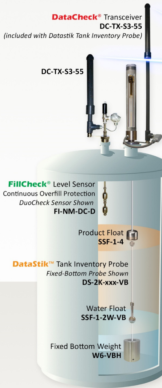
DataCheck® Transceiver DC-TX-S3-55 (included with Datastik Tank Inventory Probe)

Intrinsically-Safe ▪ Battery-Powered ▪ Wireless Tank Monitoring