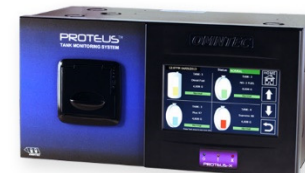
DataCheck® ATG Controller PROTEUS® OEL8000IIIX-W (installed inside control room)