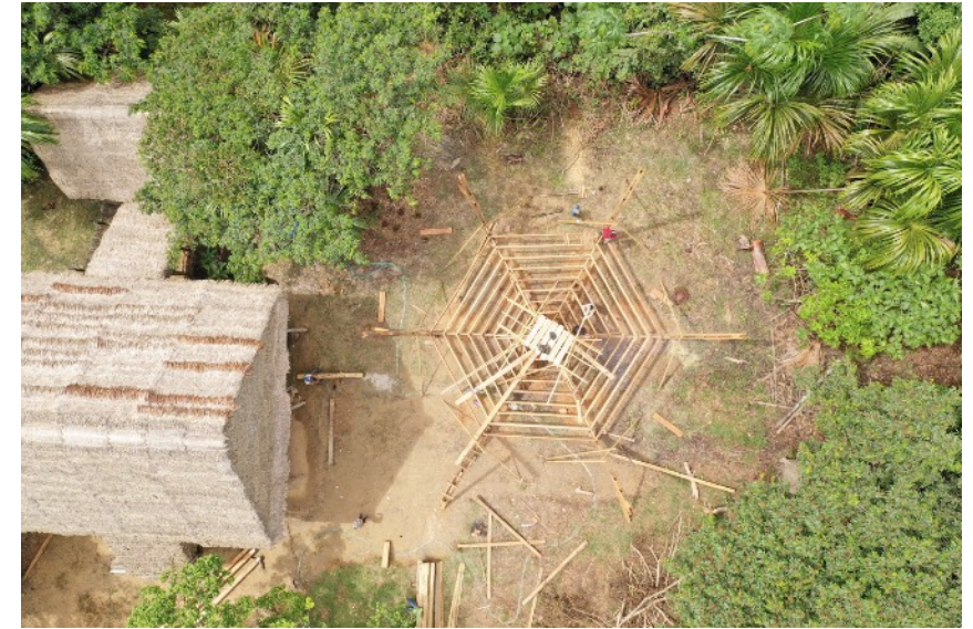
Figure 4. Botiquin 1 under construction at San Pedro village