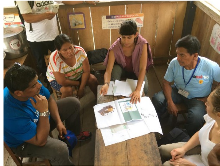
Figure 2. Co-designing with the community health workers (promotores)