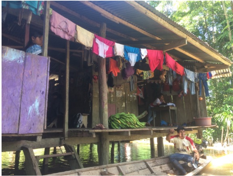
Figure 1. Life with seasonal flooding on the Napo river

Designing spaces to facilitate access to essential medicines for 5 communities on the Napo river