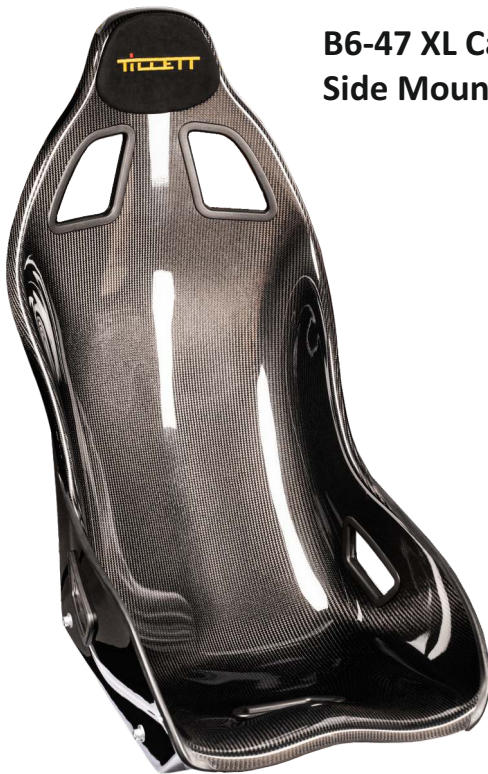
B6-47 XL Carbon GRP Side Mount

For the 8855-1999 homologated FIA version order the B6 XL Screamer.