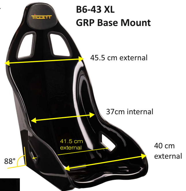
B6-43 XL GRP Base Mount

38 cm external across the base moulding 39 cm across bolting points if you have the side mount version