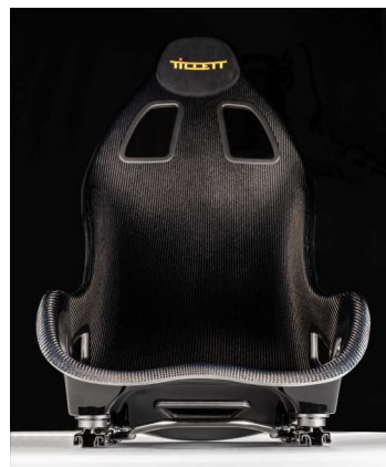
Base mount B6 XL showing PTRi runners and TK5 fitting kit fitted