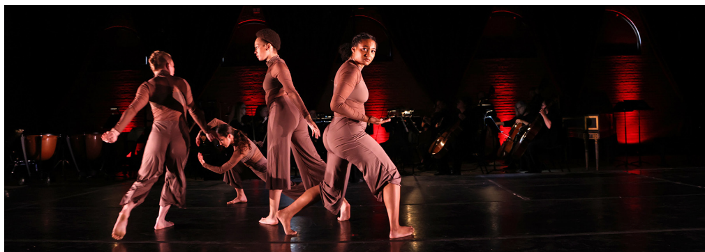
This Love Unbound, a collaboration with Urbanity Dance.

Emmanuel Music engages with audiences and musicians to explore the enduring questions of our shared human experience, building on our core commitment to the music of J.S. Bach.