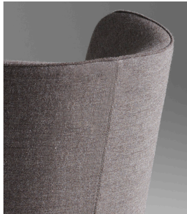
Glide Base Back