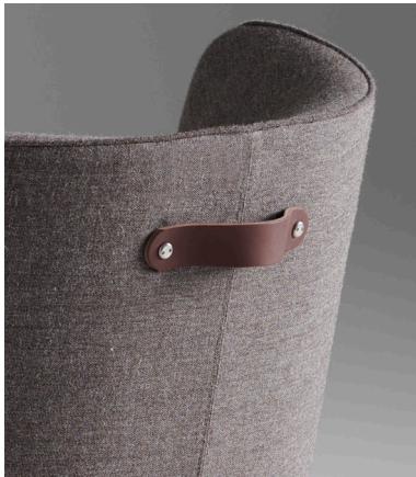
Caster Base Back Detail Standard with Pull Handle