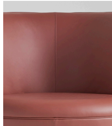
Back Seam Detail - on all leather chairs and most fabrics