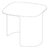
CA-1019 15 5 / 8 " High Table