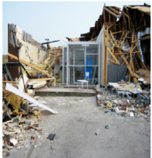
TCA Cleanroom Suite still standing after a tornado ripped through Tuscaloosa, AL in 2011.

Contact us today to get started on the road to your custom cleanroom suite.