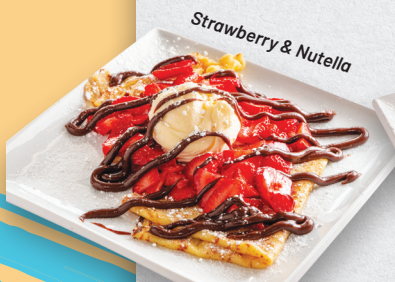
Strawberry & Nutella