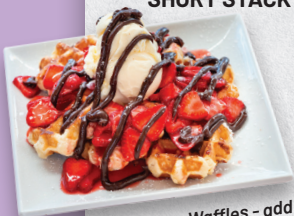
Large Waffles - add Strawberries & Nutella

Gluten Free & Vegan Pancake options are available $2 extra