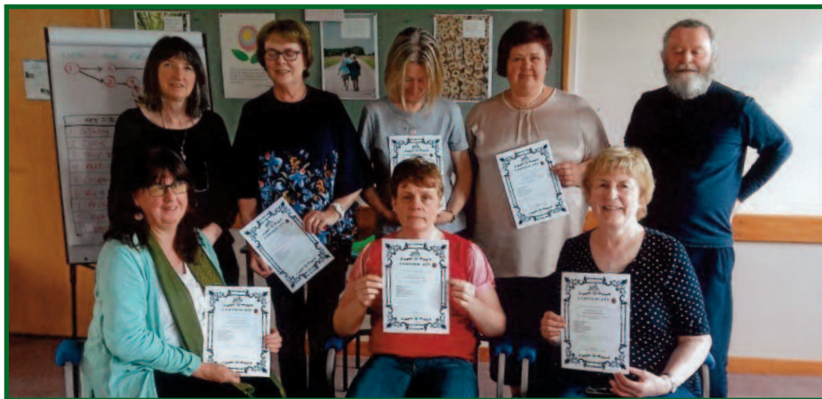
Training for Transformation

The parents were able to identify with this information and decide what issues they had the energy to tackle, which resulted in the parents deciding to do something to improve their physical and mental health which was at risk due to the stress under which they were living. This initiative empowered the parents to help themselves in what seemed like a helpless situation.