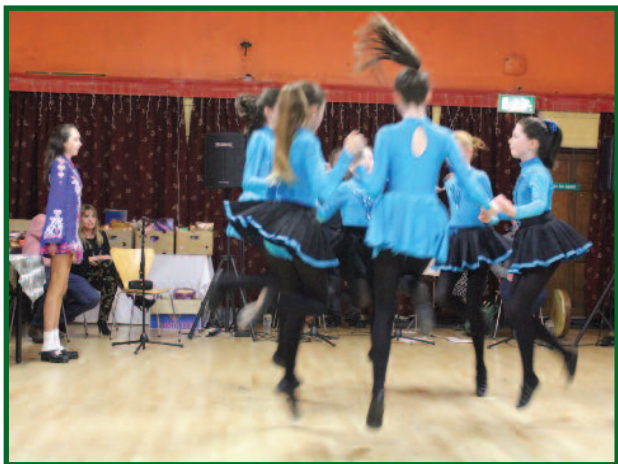
Children from the Louise Curran School of Dancing entertain at the Social Gathering.