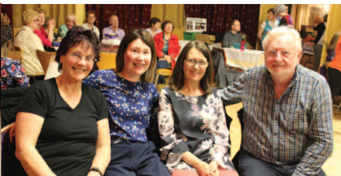
Set Dancers enjoying the night