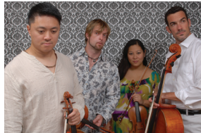
Miro String Quartet