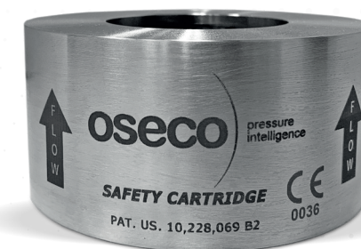
FIGURE 2 OSECO Safety Cartridge™