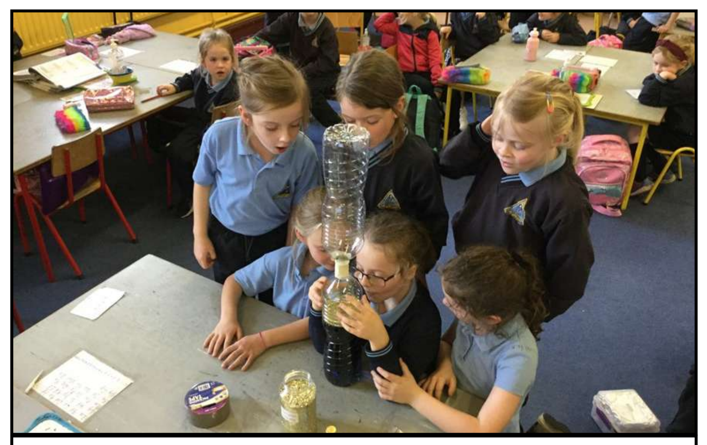
Senior Infants & First Class

Artistic pumpkins, Halloween themed play stations, Maths games and building lava lamps are a selection of the activities undertaken by the girls of Senior Infants and First Class recently.