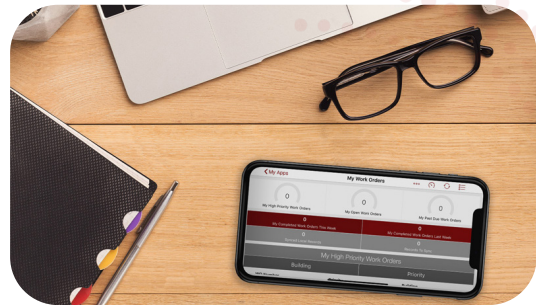
Comprehensive, real-time reports and dashboards