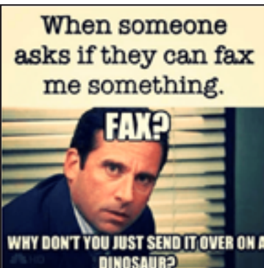
Answers on page 17.