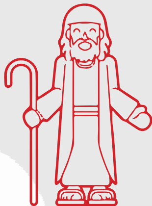
The Son (Jesus)

To the Father - '... to your father' (Matthew 6:6) - '... in heaven' (v.9)