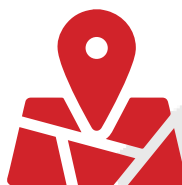
Find a place