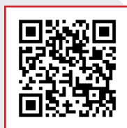
Bible in One Year