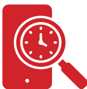
Find a time