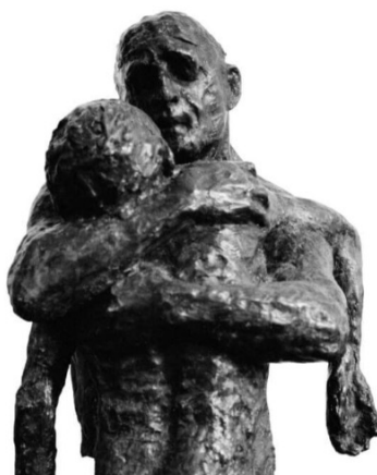
The Prodigal Son by Charles Mackesy