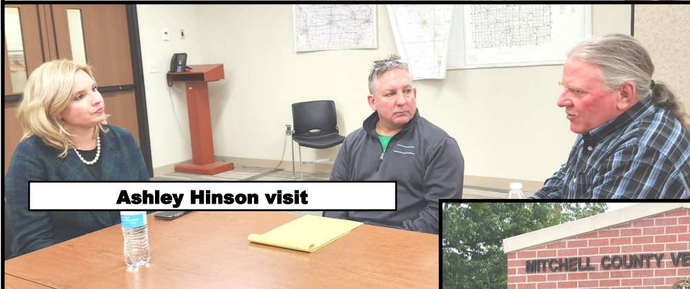
Ashley Hinson visit