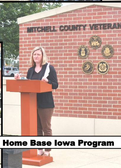
Home Base Iowa Program