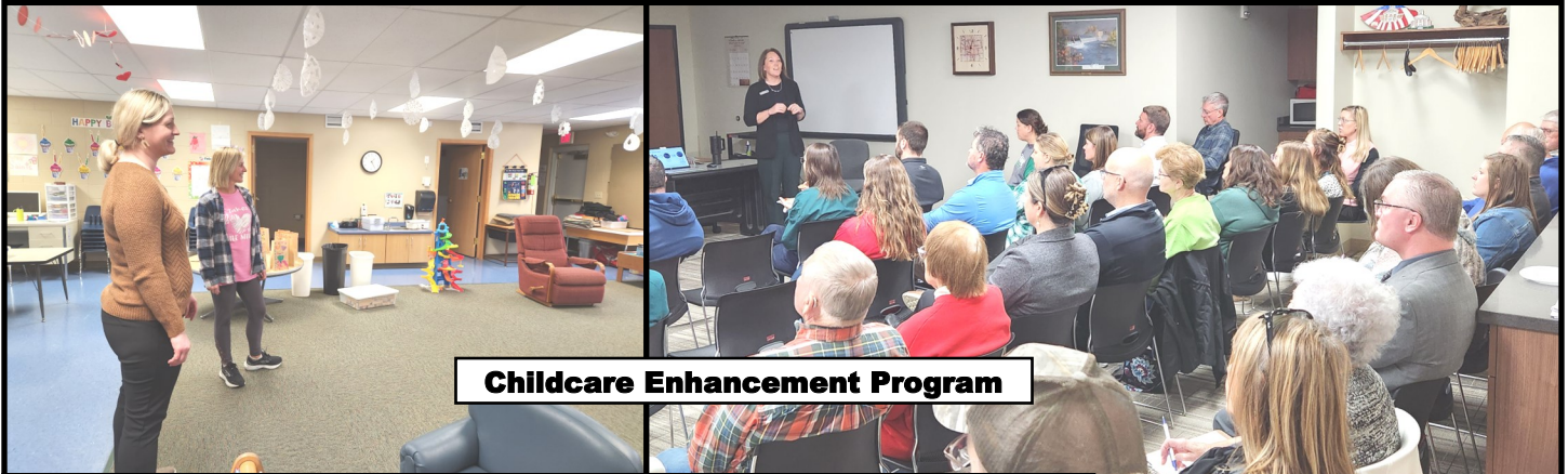
Childcare Enhancement Program