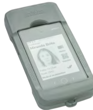
QR- Scanner for scanning 1D/2D codes OrderCode: X-H-S1-1.0