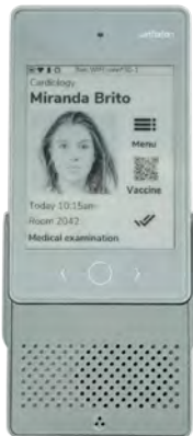
Audio Module for Voice messages and extra loud alarm sounds OrderCode: X-H-A1-1.0