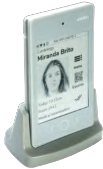
Charging Brick single charging (USB-C) OrderCode: X-H-C1-1.0