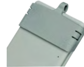
Lanyard-Clip OrderCode: X-H-H1-1.0