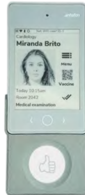
Apple Airtag module OrderCode: X-H-A2-1.0