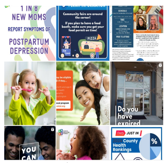
CDHD's Instagram Page

30.4% are from Wenatchee 13.8% are from East Wenatchee 4.1% are from Chelan 3.7% are from Leavenworth 3.6% are from Cashmere 1.9% are from Manson 1.3% are from Malaga 42.6% are from outside Chelan & Douglas counties (To include, but not limited to: Moses Lake, Seattle, Tri-Cities)