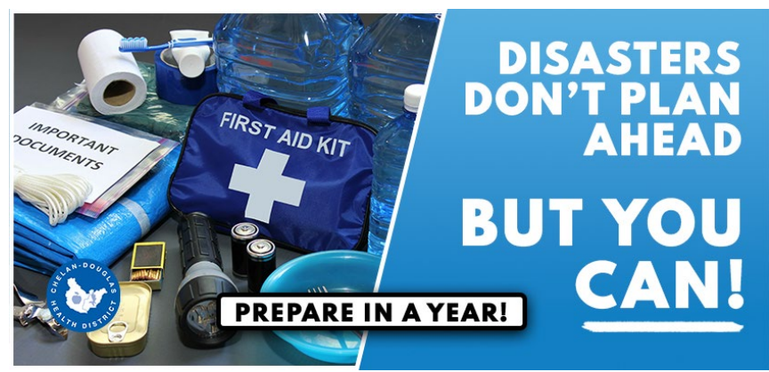
Current billboard on Sunset Ave., Highway 97A and Wenatchee Ave.