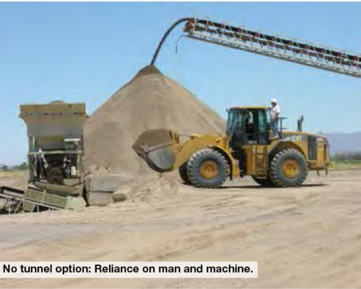
No tunnel option: Reliance on man and machine.