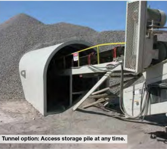
Tunnel option: Access storage pile at any time.

Australian distributor Mobile Conveying Services www.mobileconveyors.com.au or call 1300 665 409