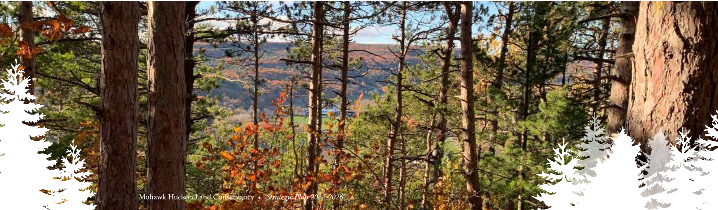
Photos, left to right: View from the overlook at Bennett Hill Preserve. | Participants of MHLC's Full Moon Hike head to a clearing at Switzkill Farm to wait for the moon to rise. Families enjoyed searching for gnomes at the preserves during MHLC's Summer Hike-a-thon Scavenger Hunt.