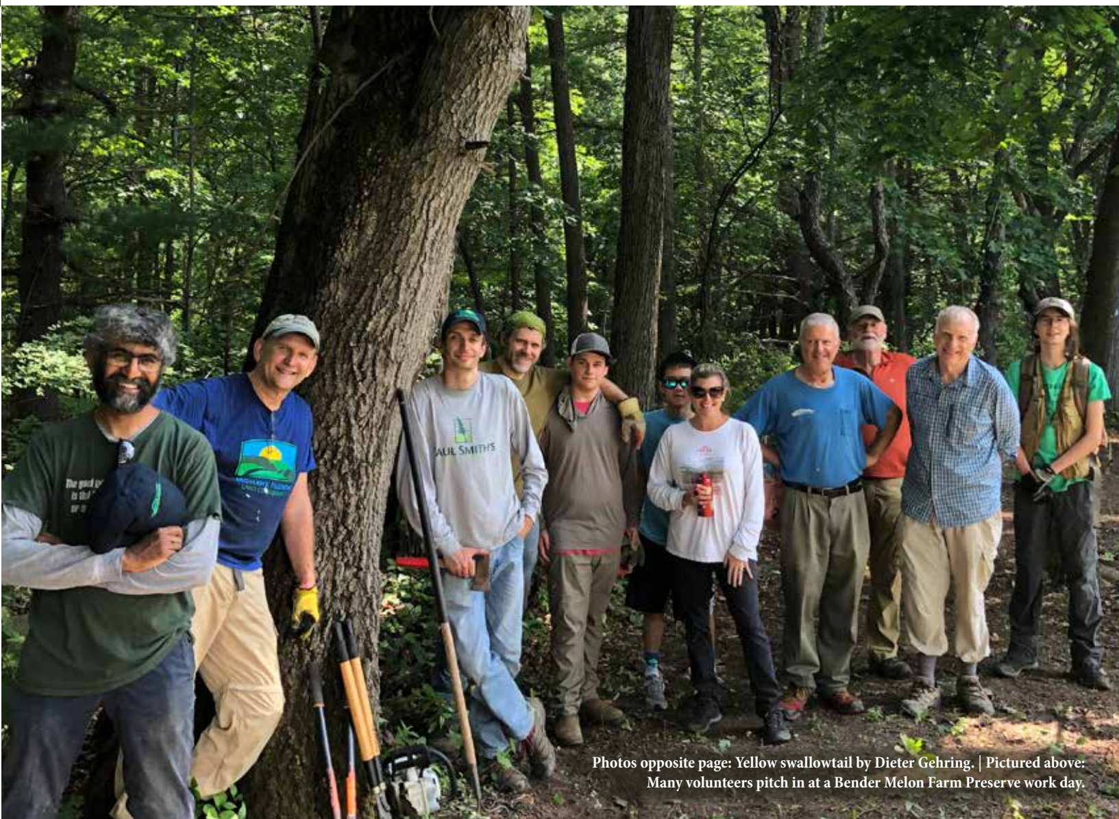
Photos opposite page: Yellow swallowtail by Dieter Gehring. | Pictured above: Many volunteers pitch in at a Bender Melon Farm Preserve work day.