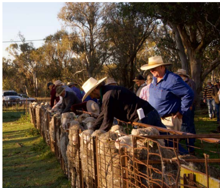
Merino sheep breeding in the Walcha district.

So mark your calendars, gather your fellow wool aficionados, and join us for an unforgettable day celebrating the excellence of commercial