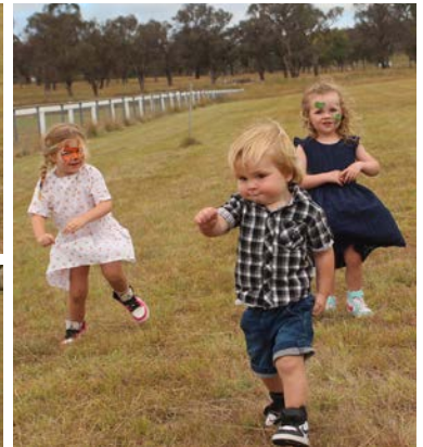
Local youngsters keen to win in the junior section.