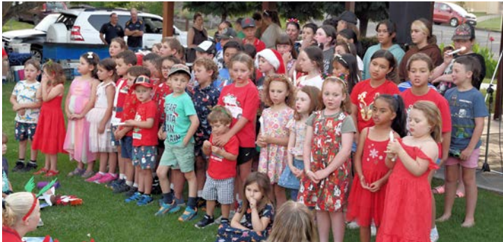
Pictured at top: Local Walcha singers performing at what was the town's biggest Carols in recent years. Students from Walcha Central (above) and St Patrick's School (below) performing carols. Bottom: McHattan Park looked a picture after dusk as candles were lit.