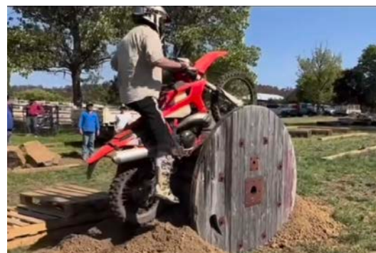
Come along and try the Enduro X course at the Walcha Showground this Friday and Saturday.

While you are in town for the procession, you can spend time at the Walcha Farmers' Market between 10am and 12 noon, which will also feature