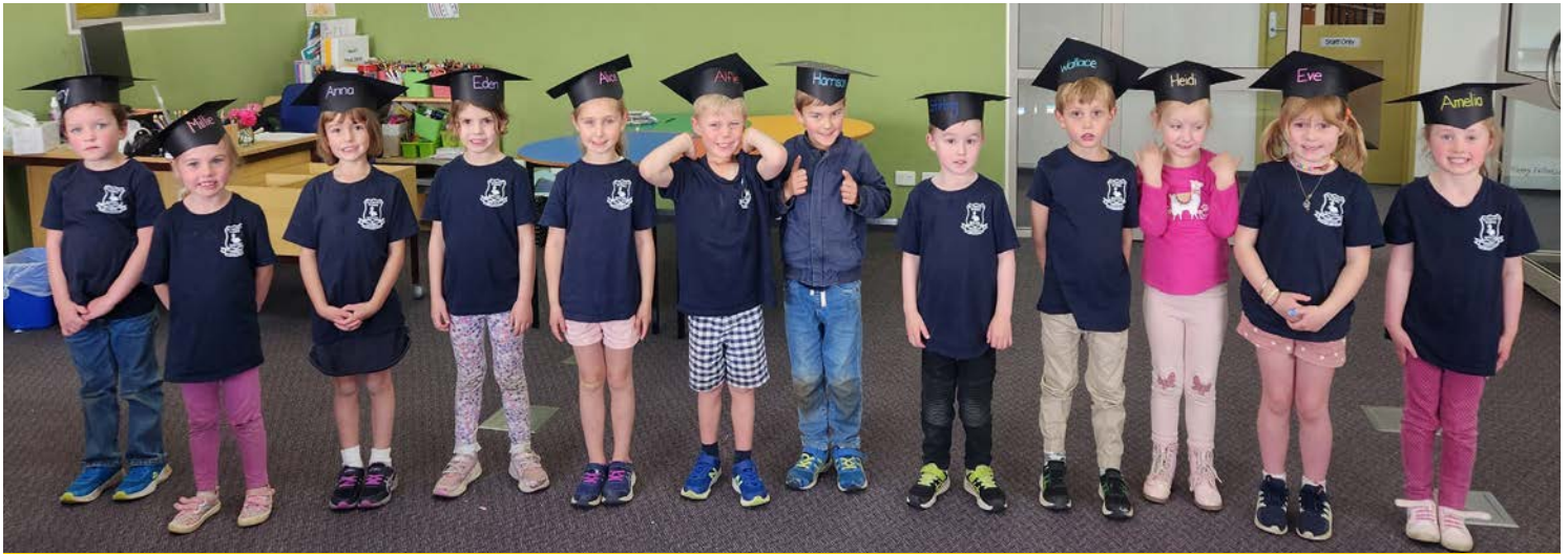
St Patrick's Transition students getting ready for their graduation ceremony

Last Friday, St Patrick's Primary School celebrated the graduation of their Transition students who are now ready to begin kindergarten in 2024. The Transition program helps prepare young children for their first year of school, ensuring that they have the skills and confidence they need to succeed.