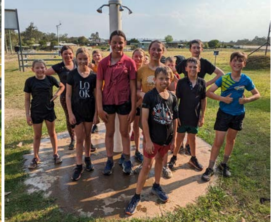
The Year 5-6 students enjoying a shower after completing the Commando Course