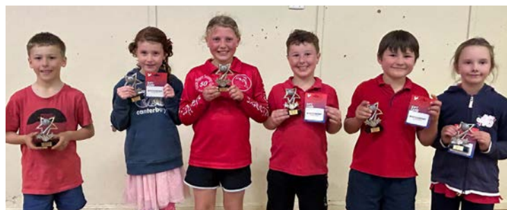
Yr 2-3 Minor and Major Premiers Red Fire