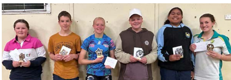
Yr 7-12 prize winners