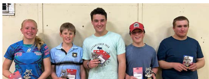
Yr 7-12 Minor and Major Premiers Blue Rangers