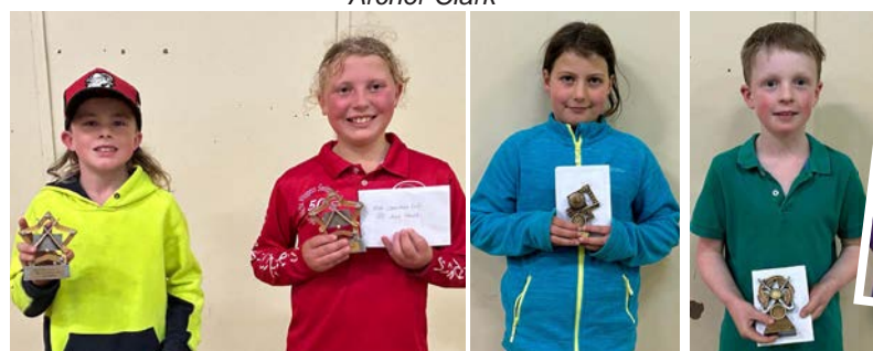
2-3 prize winners