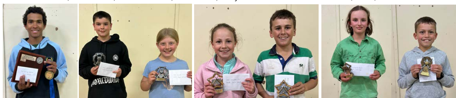
Trish Partridge award