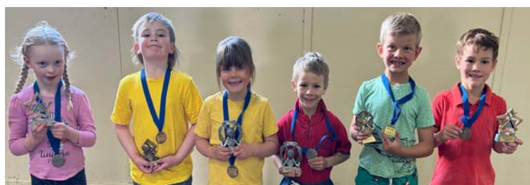
K-1 prize winners