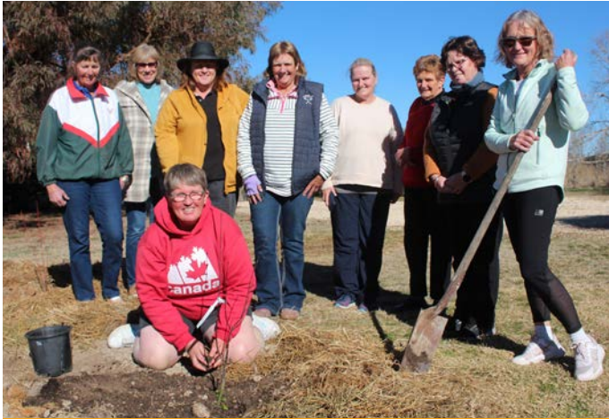
Thursday tennis ladies planting the tree