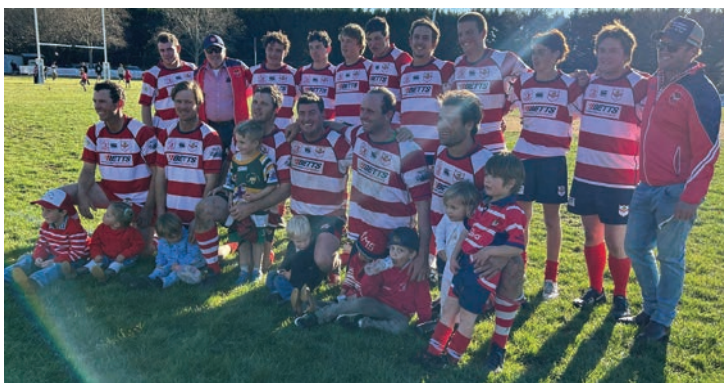
Walcha Rams Reserve Grade team who defeated Gunnedah on Saturday

Contributions will be received in person, by phone or email and must be accompanied by your name and contact details . They will be printed at the discretion of the editor.