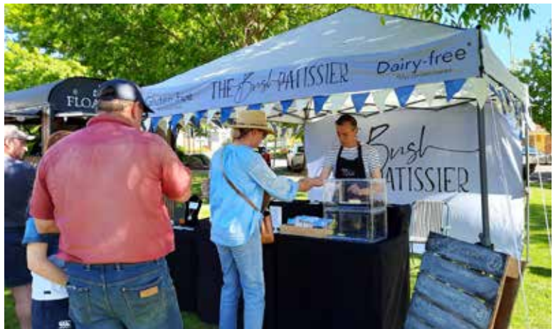
Enjoy gluten-free, dairy-free tarts and macarons from The Bush Patisserie

Meet your friends for coffee and a snack, and enjoy the markets in the beautiful surrounds of McHattan Park in Walcha, while the kids play on the park play equipment. 8:30am to 12:30pm, Saturday 18th March.