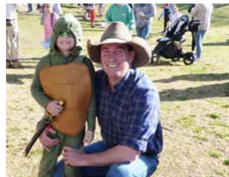
Dads, pops, uncles and friends enjoyed the great breakfast