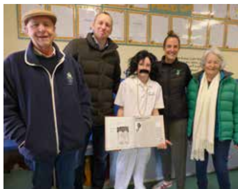
Children were very excited to have visitors at the school and to show their work too.