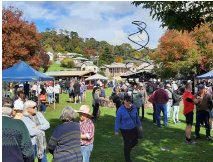
It won't be long McHattan Park will come alive with Walcha's monthly Farmers' Markets

If you are part of a community group or club which would like to have a promotional stall at the Farmers' Market, please contact the