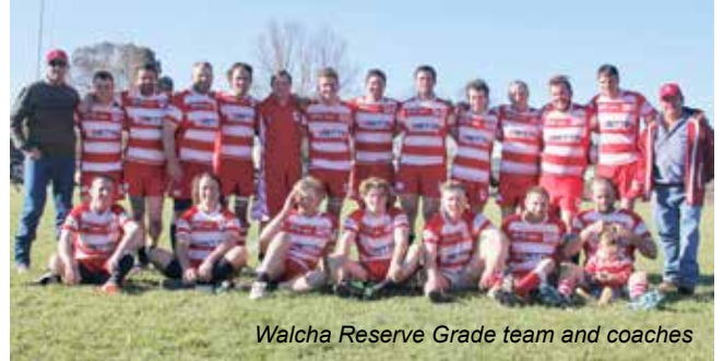
Walcha Reserve Grade team and coaches