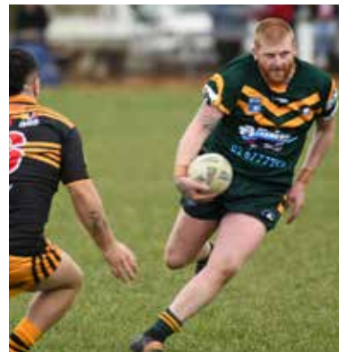
Plenty of action on the field last Saturday at Walcha

This Sunday Walcha are again hosts when Uralla/Walcha take on Tingha here at Peter Fenwicke Oval with all the Ladies League Tag action kicking off at 1.00pm.