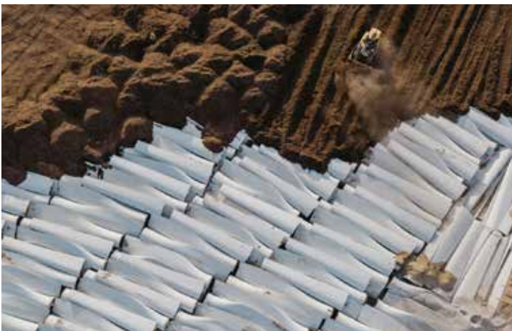
Picture: Fragments of wind turbine blades await burial at the Casper Regional Landfill in Wyoming, dwarfing a bulldozer in top right of picture.

By law, mining companies have to hold funds in place to de-commission and re-habilitate end of life mines. This is not the case for wind farms, and landholders will be relying on the good will of an international conglomerate to cover this cost, (estimated to be in the order $0.5M per wind tower) while not gaining any further financial benefit from the project. If they indeed do come to the party to cover de-commissioning costs, these turbine blades will need to be buried as landfill, somewhere in the Walcha district. Walcha Landfill is already struggling with the cost of assigning new and updated waste processing space. The scale of material to be buried is not to be underestimated.