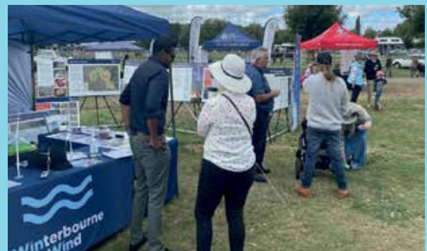
Visitors at the info booth at the Walcha Show 2022.

Several participants indicated that they 'felt reassured and better informed' after the conversations with members of the project team. Valuable feedback was obtained from the community