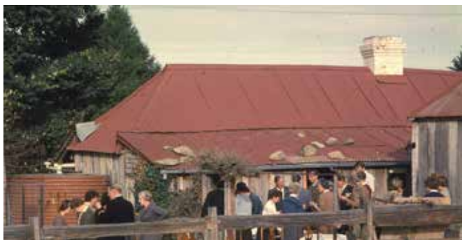
A gathering at the rear of the Pioneer Cottage in 1963

The Pioneer Cottage, together with old stone Anglican Church, are believed to be the oldest buildings in the town of Walcha.