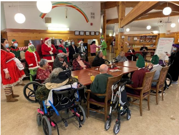
Movie Trivia Contest with the Avens Manor residents and AVENS staff. Who knows their movie trivia the best?