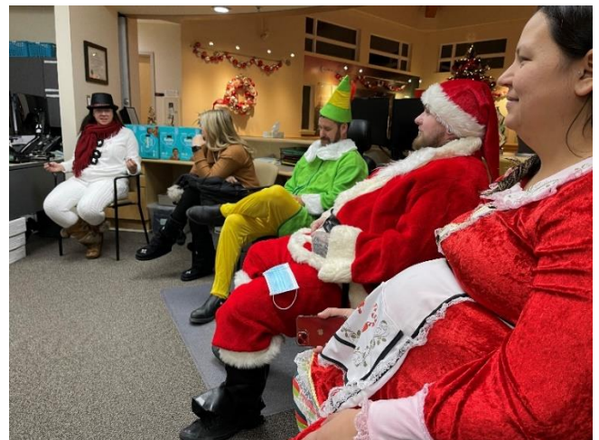
Dress-up as your favorite Christmas Movie Character Day! You can see that many Management and Care staff get pretty creative for this one

This time of year always brings out the best at AVENS.