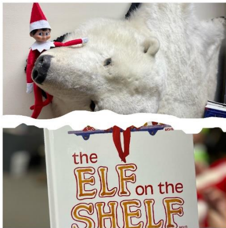
NEW for this year in Administration...Elf on the shelf every day in December. Today, our naughty Elf decided to take on the CEO's polar bear rug!