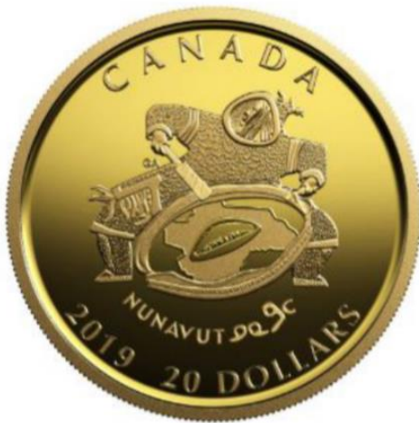
The coin bears the same design the toonie did when Nunavut became a territory.

This toonie was designed to light the way forward when Nunavut was created.