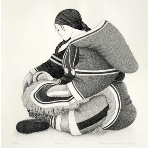
This drawing by artist Germaine Arnaktauyok is titled Mother and Child.

For over 60 years she has been drawing, in fact, the council did state in the CBC article that, “Arnaktauyok’s rich and beautifully coloured drawings depict a kaleidoscope of her heritage, ranging from astronomy to mythology to philosophy of forgotten times”