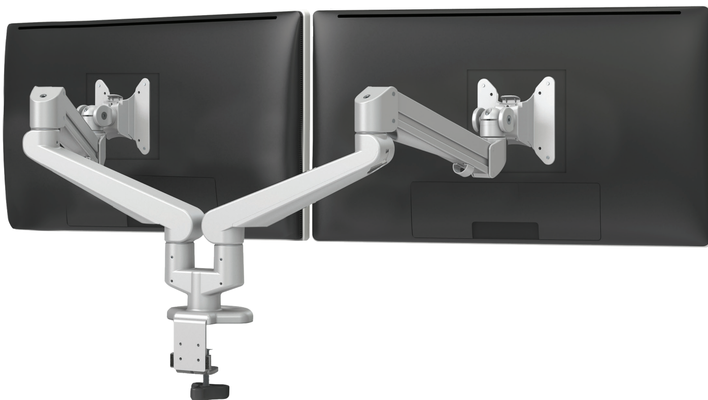
Edge ® 2 Dual monitor arm