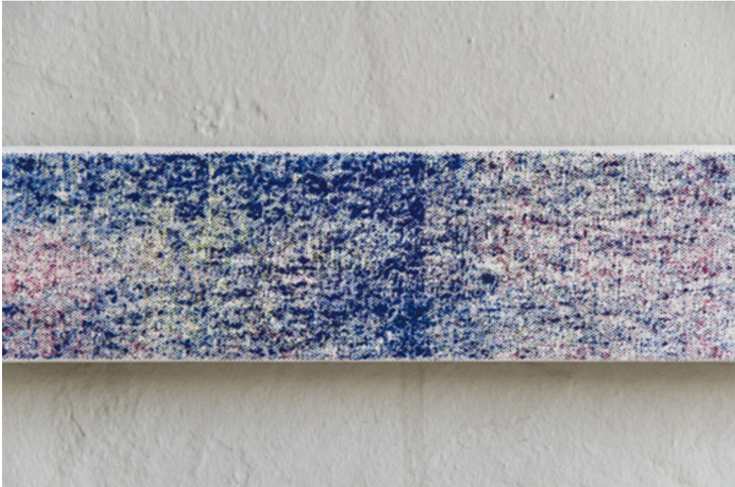
Untitled (detail), 2016