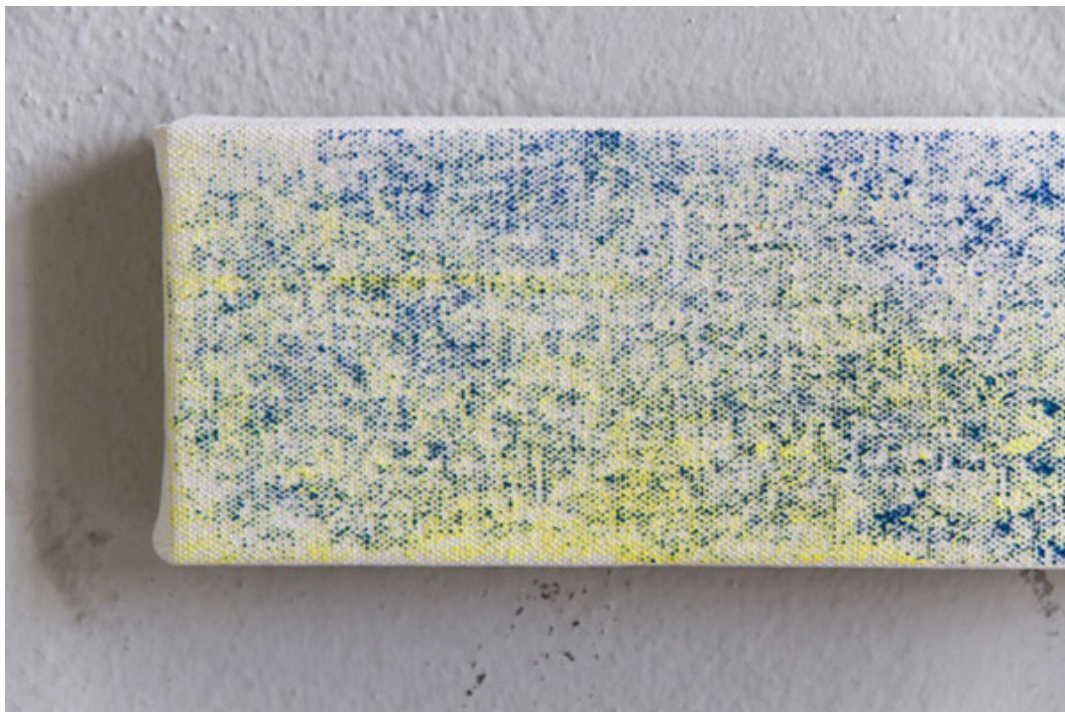
Untitled (detail), 2016