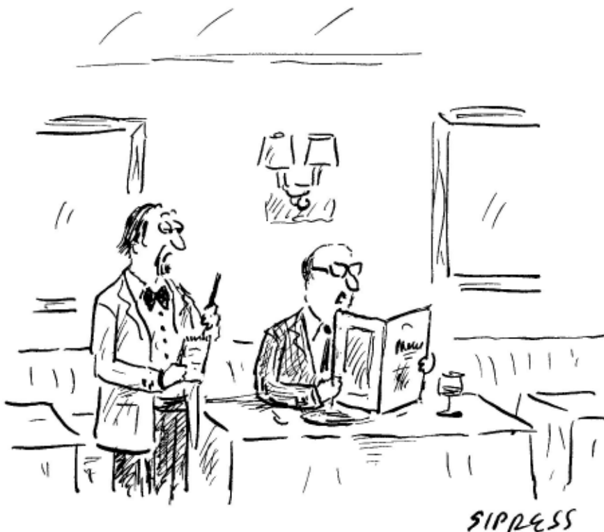
"What will change my life?"