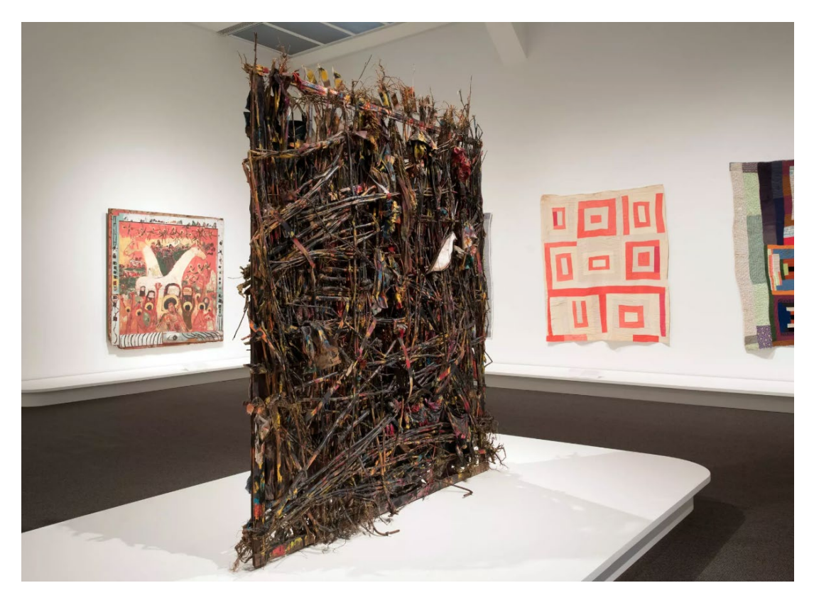
The reverse side of Dial's relief-painting-assemblage, "History Refused to Die," is a rough weaving of okra plant stalks, with a white dove of peace or freedom. At left, Purvis Young's "Locked Up Their Minds," 1972, and at right, Lola Pettway's "Housetop." Credit2018 Purvis Young/Artists Rights Society (ARS), New York; 2018 Estate of Thornton Dial/Artists Rights Society (ARS), New York Times

Several other works here are similarly simply masterpieces. In "Locked Up Their Minds," Purvis Young offers his own version of James Ensor's "Christ's Entry Into Brussels in 1889." Young's large painting on wood shows a group of black figures, some with halos, others holding up padlocks signifying their freed minds to flocks of angels, while two immense white possibly rampant horses add to the drama. The show's coda is Dial's ironically titled "Victory in Iraq," a relief-painting from 2004. It hangs just outside the second gallery, its barbed wire and twisted mesh against a field of fabric and detritus defines and holds space as lightly and powerfully as Jackson Pollock's "Autumn Rhythm," displayed nearby.