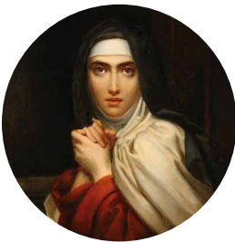
Teresa of Avila

We join together in this Mass to give thanks for the witness and ministry of these two Jesuits from the beginning of the Society of Jesus and to pray that God will continue to call men to this way of life, and give them the grace to respond to his call.