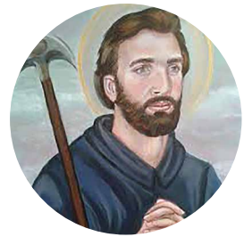
Isidore the Farmer